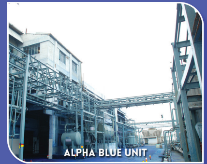
ALPHA BLUE UNIT